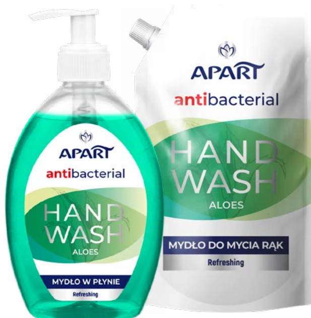
Antibacterial Liquid Soap Aloe Vera 500 ml & refill 400 ml