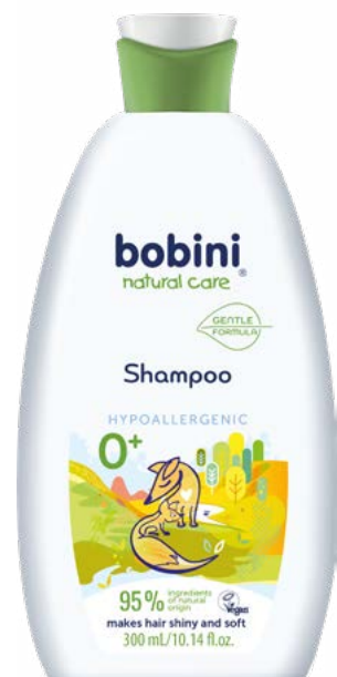
Shampoo Hypoallergenic, 300 ml