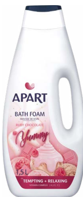
Bath Foam Ruby Chocolate, 1,5 L