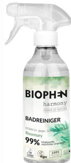
Bathroom cleaner Rosemary, 480 ml