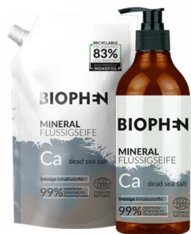
Mineral Liquid Soap dead sea salt 300 ml & refill 500 ml