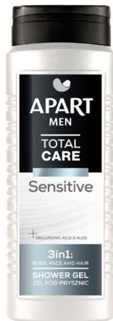
Shower Gel 3in1 TOTAL CARE Sensitive, 500ml