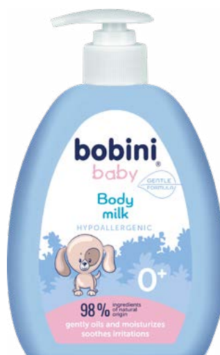
Body milk Hypoallergenic, 300 ml