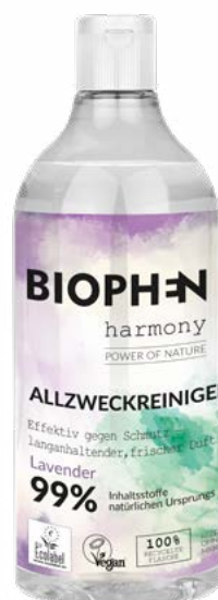
All purpose cleaner Lavender, 480 ml