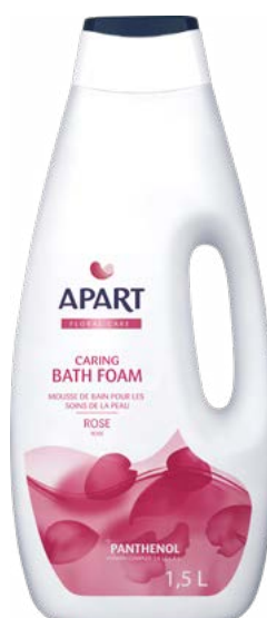
Relaxing Bath Foam Rose, 1,5 L