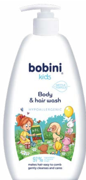
Body & hair wash Hypoallergenic, 500 ml