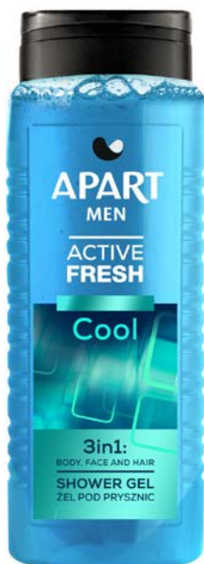
Shower Gel 3in1 ACTIVE FRESH Cool, 500ml