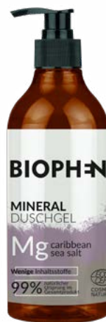
Mineral Shower Gel caribbean sea salt, 300 ml