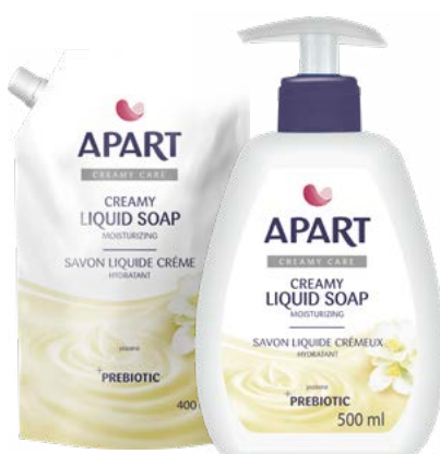
Creamy Liquid Soap Jasmine, 500 ml & refill 400 ml