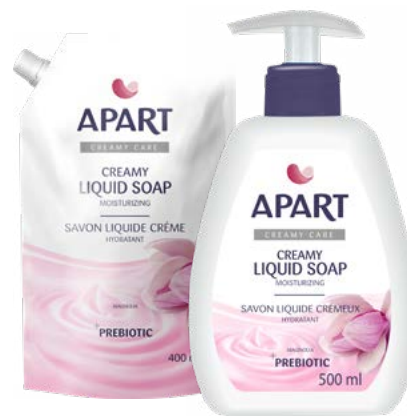
Creamy Liquid Soap Magnolia, 500 ml & refill 400 ml