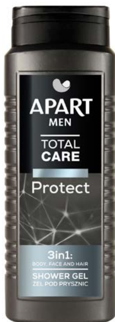
Shower Gel 3in1 TOTAL CARE Protect, 500ml