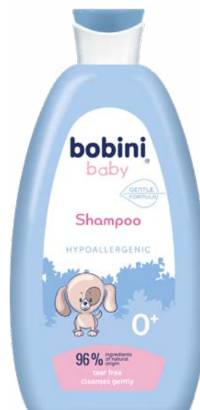
Shampoo Hypoallergenic, 300 ml