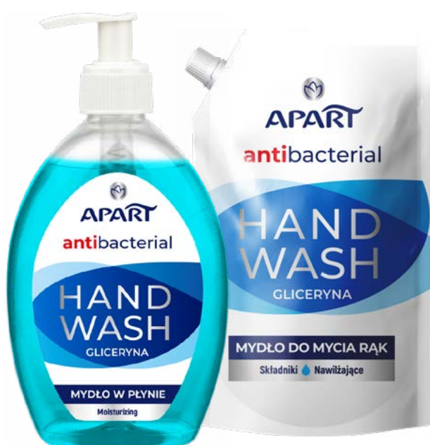
Antibacterial Liquid Soap Glycerine 500 ml & refill 400 ml