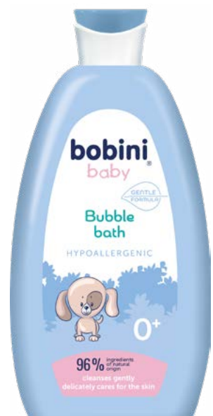
Bubble bath Hypoallergenic, 300 ml