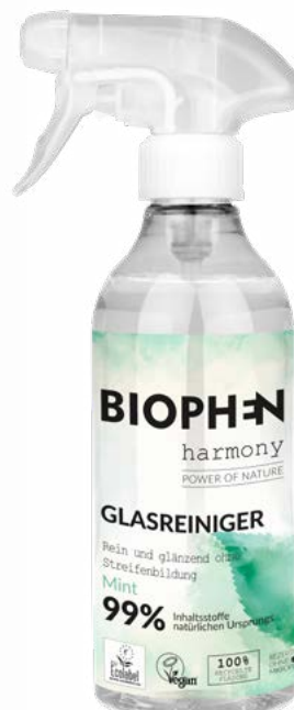
Window cleaner Mint, 480 ml