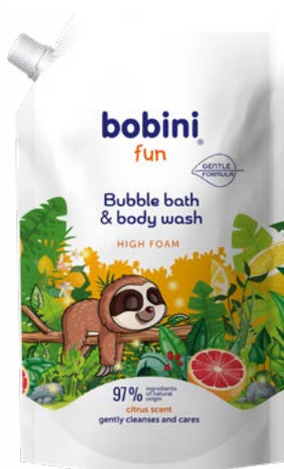
Bubble bath & body wash - Citrus scent, 500 ml & refill 500 ml