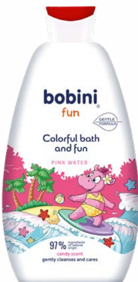
Colorful bath and fun - Pink water, 500 ml