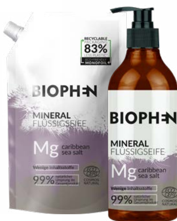
Mineral Liquid Soap caribbean sea salt 300 ml & refill 500 ml