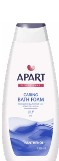
Caring Bath Foam Lily, 750 ml