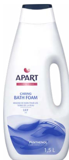
Relaxing Bath Foam Lily, 1,5 L