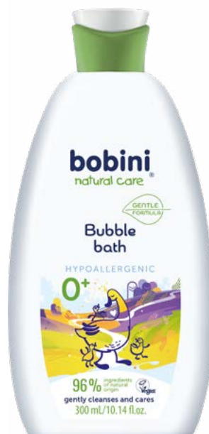
Bubble bath Hypoallergenic, 300 ml