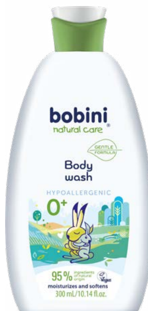
Body wash Hypoallergenic, 300 ml