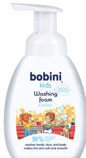
Washing foam - Caring, 300 ml