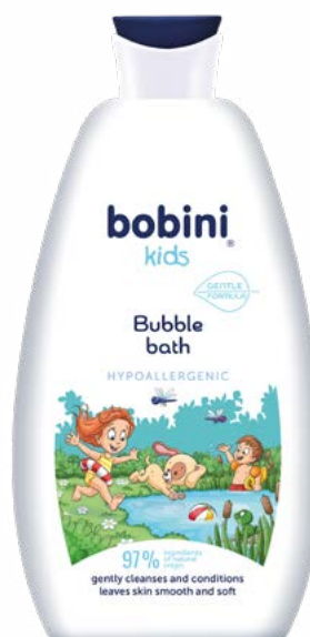
Bubble bath Hypoallergenic, 500 ml