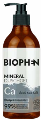
Mineral Shower Gel dead sea salt, 300 ml