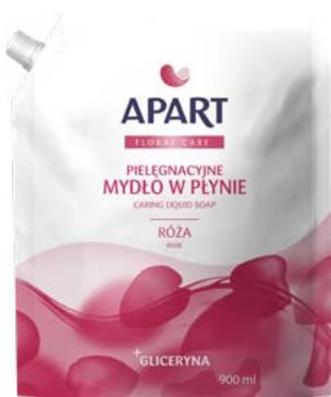
Caring Liquid Soap Rose, refill 900 ml