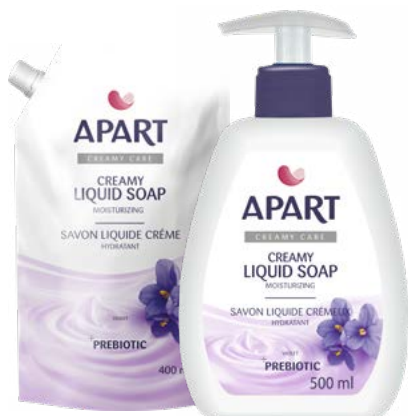
Creamy Liquid Soap Violet, 500 ml & refill 400 ml