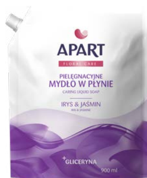
Caring Liquid Soap Iris, refill 900 ml