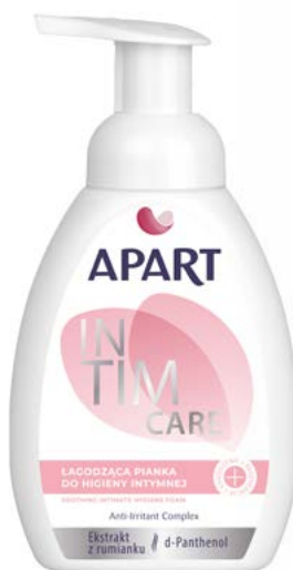
Soothing intimate hygiene foam, 300 ml