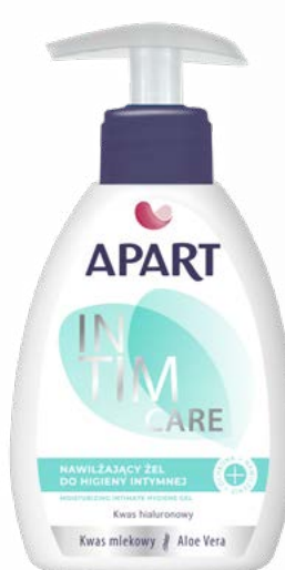
Moisturizing intimate hygiene gel, 300 ml