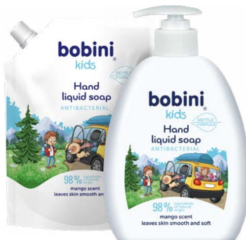
Hand liquid soap - Antibacterial, 300 ml & refill 300 ml

UP TO 98 % INGREDIENTS OF NATURAL ORIGIN