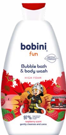
Bubble bath & body wash - Raspberry scent, 500 ml