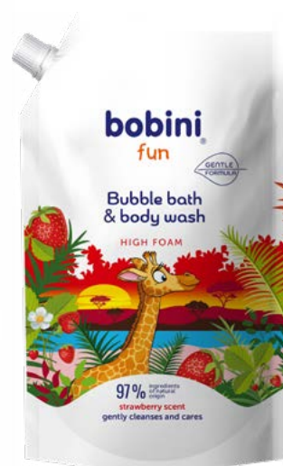
Bubble bath & body wash - Strawberry scent, 500 ml & refill 500 ml