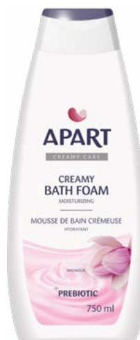
Creamy Bath Foam Magnolia, 750 ml