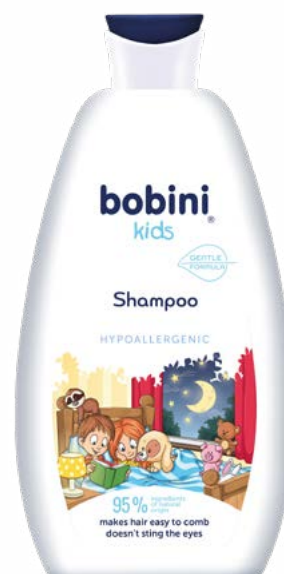
Shampoo Hypoallergenic, 500 ml