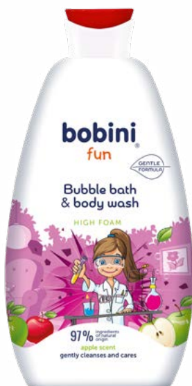
Bubble bath & body wash - Apple scent, 500 ml