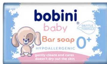
Bar soap Hypoallergenic, 90 g

Shea butter moisturizes the skin, it supports regeneration of irritated epidermis.