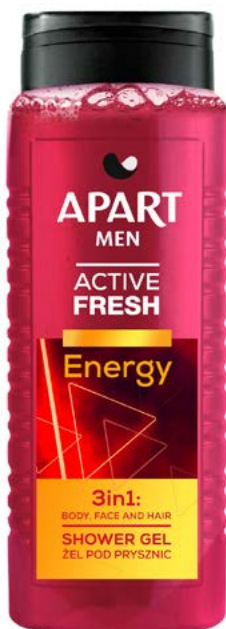
Shower Gel 3in1 ACTIVE FRESH Energy, 500ml