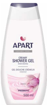
Creamy Shower Gel Magnolia, 500 ml