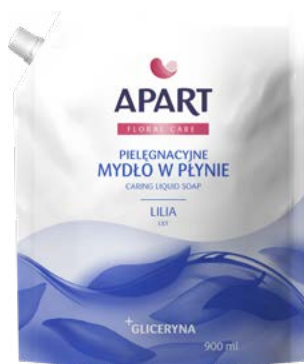
Caring Liquid Soap Lily, refill 900 ml