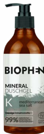
Mineral Shower Gel mediterranean sea salt, 300 ml