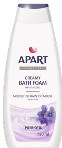
Creamy Bath Foam Violet, 750 ml