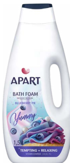
Bath Foam Blueberry Pie, 1,5 L

The INTIM CARE line is a gel and foam for intimate hygiene for women as well as a specially dedicated gel for men. The products gently wash and care for a long-lasting feeling of freshness, have a positive effect on the natural bacterial flora, soothe irritations and protect the mucosa.