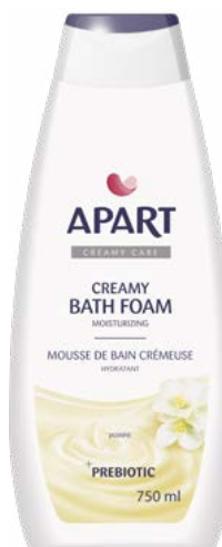
Creamy Bath Foam Jasmine, 750 ml