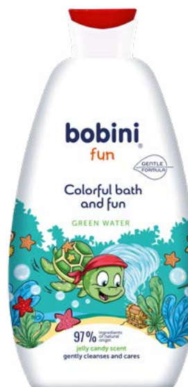
Colorful bath and fun - Green water, 500 ml