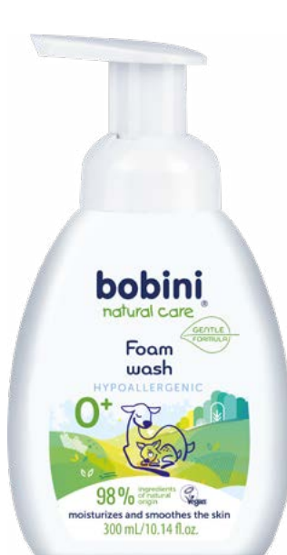
Foam wash Hypoallergenic, 300 ml