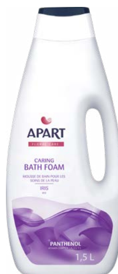
Relaxing Bath Foam Iris, 1,5 L