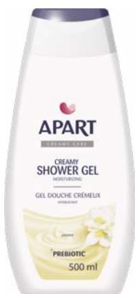
Creamy Shower Gel Jasmine, 500 ml