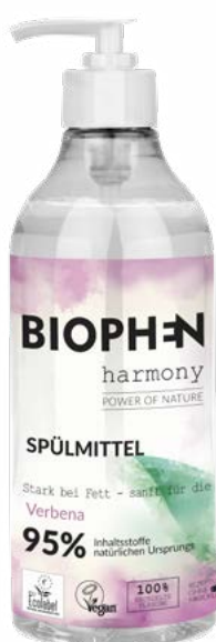
Dish washing liquid Verbena, 480 ml