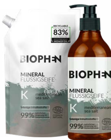
Mineral Liquid Soap mediterranean sea salt 300 ml & refill 500 ml