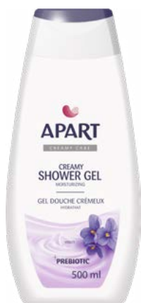
Creamy Shower Gel Violet, 500 ml