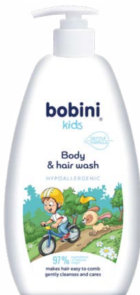
Body & hair wash Hypoallergenic, 500 ml