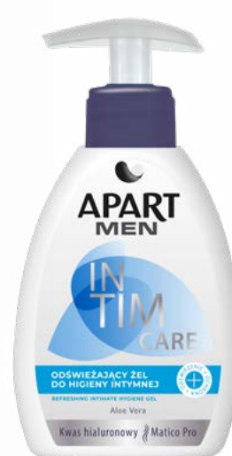
Refreshing intimate hygiene gel, 300 ml