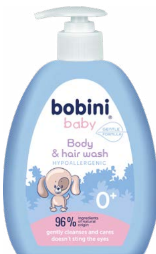
Body & hair wash Hypoallergenic, 300 ml